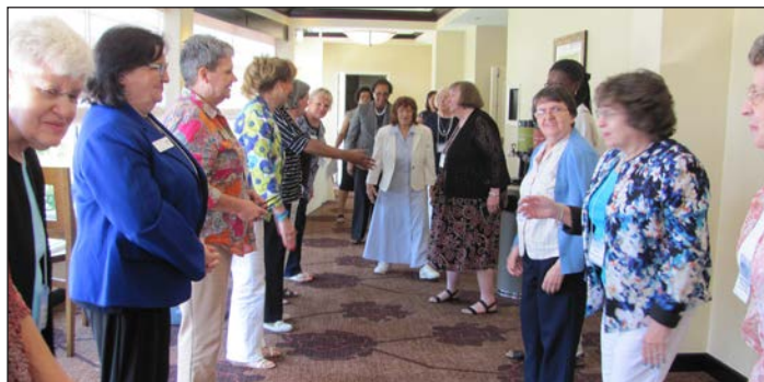
Leadership Retreat attendees out in hallway for an interactive Civility exercise.