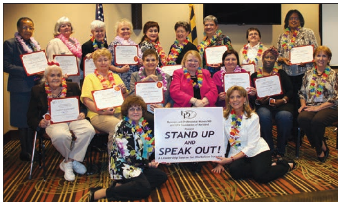
IDP students gather with instructors after completion of IDP “Stand Up and Speak Out” at Annual Conference.