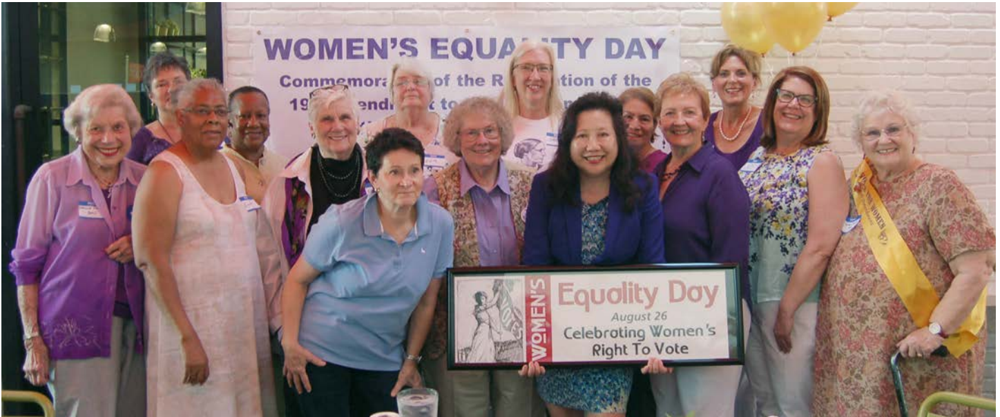
Attendees are all smiles as they celebrate Women's Equality Day at an event in Bethesda co-sponsored by Montgomery County BPW and Montgomery County NOW. Special thanks to Senator Susan Lee (holding Equality Day sign) for attending.