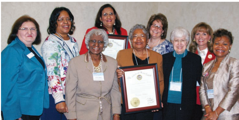
BPW/MD Officers pose with 2015 Women of the Year and Employer of the Year