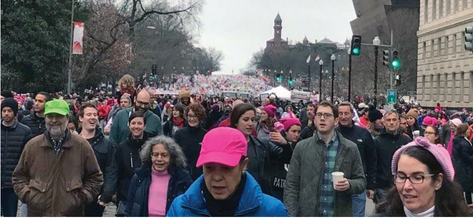
Crowds at the Women's March on Washington, January 21, 2017

B PW/MD, like our sister organizations, is committed to fighting to protect and advance the fundamental rights of women and families, many of which we now see under attack. On January 21, BPW members joined thousands of women from all over the country in the Women's March on Washington . It was an exhilarating show of solidarity to say that we will not go back, that we are determined to move forward for equality and justice.