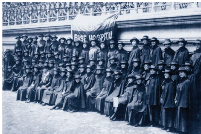
Photo: Taken on the dock in New York City, June 14, 1917, before the nurses boarded the USS Finland to cross the Atlantic. “In our blue capes — we were a picture!”

Maryland spoken word artist Ellouise Schoettler is known for seeking stories of unknown women—then bringing them to life with “heart and humor.” “Ready to