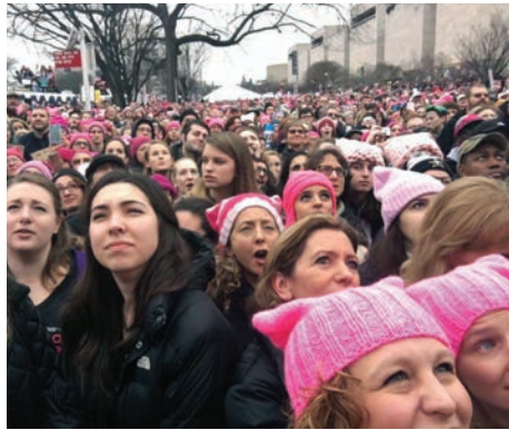
More crowds at the Women's March