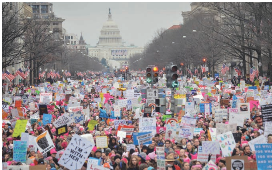
BPW members were among the 500,000 at the Women's March on Jan. 21.