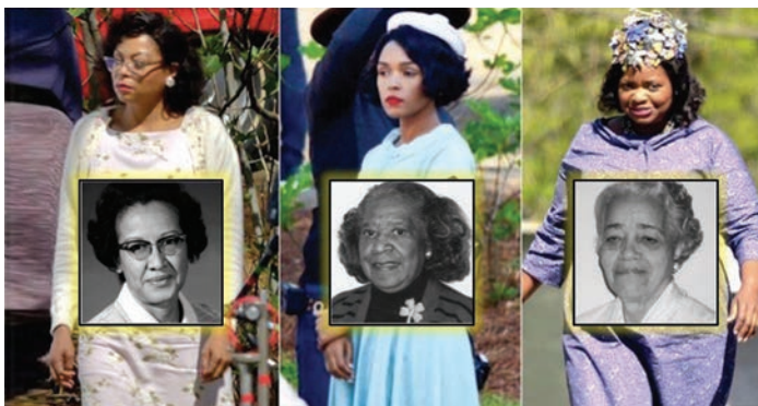
L-R: Katherine Johnson (played by Taraji P. Henson), Mary Jackson (played by Janelle Monáe) and Dorothy Vaughn (played by Octavia Spencer)