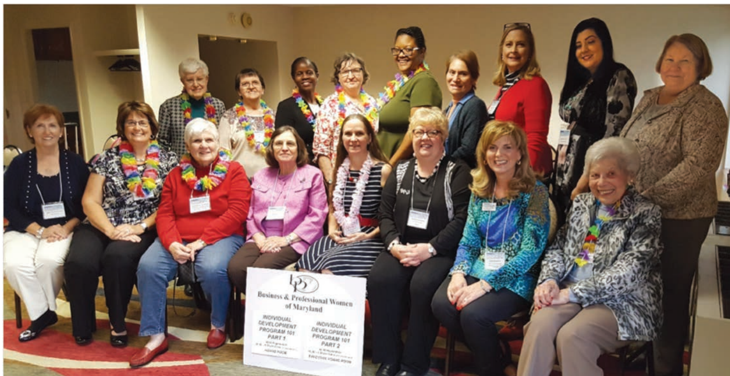
Graduates of IDP Parts 1 and 2 pose with course facilitators at the end of the day.